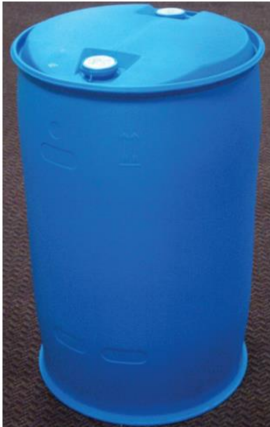
Image of 210 l, XL Ring Drum