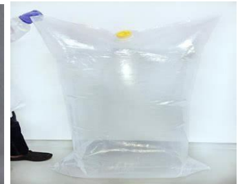
Pillow type liner