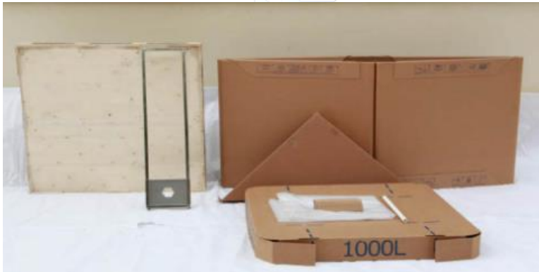
Unwrapped image of Paper IBC