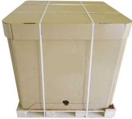
Packed and ready to ship