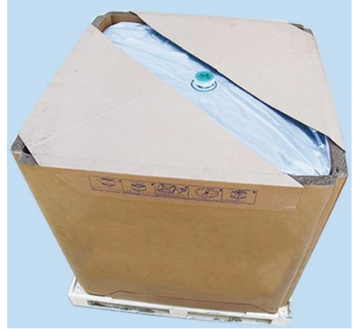
Liquid filled Paper IBC