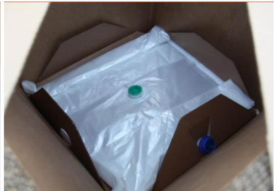
Cassette Image once unwrapped