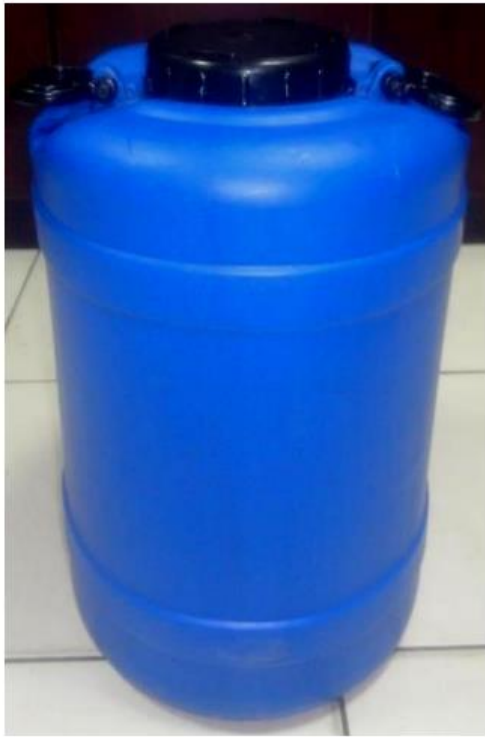
Images HM-HDPE Container