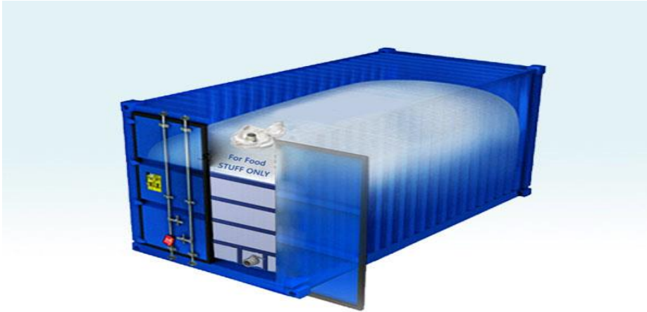
Flexi Tank – Top cross-section view