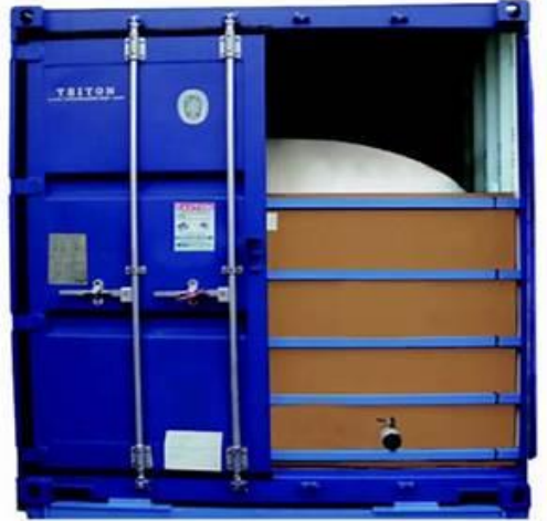
Flexi Tank – Front-section view