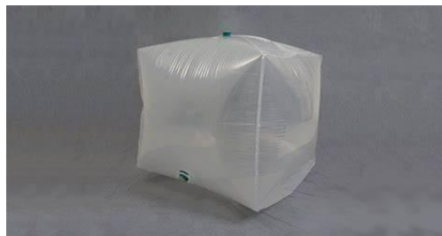
Cube type liner