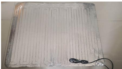
Electric heater pad