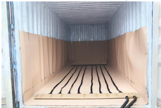
Steam Heater pad layout – Type 1