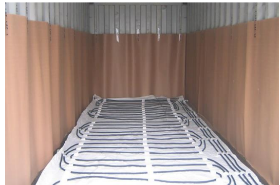
Steam Heater pad layout – Type 2